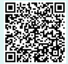
Humly Room Display

Humly Room Display is the perfect interactive display for your collaboration spaces. WiFi, Bluetooth and USB disabled from factory assures next level security. It will help you to find the space you already booked, or guide you to one that is available right now.