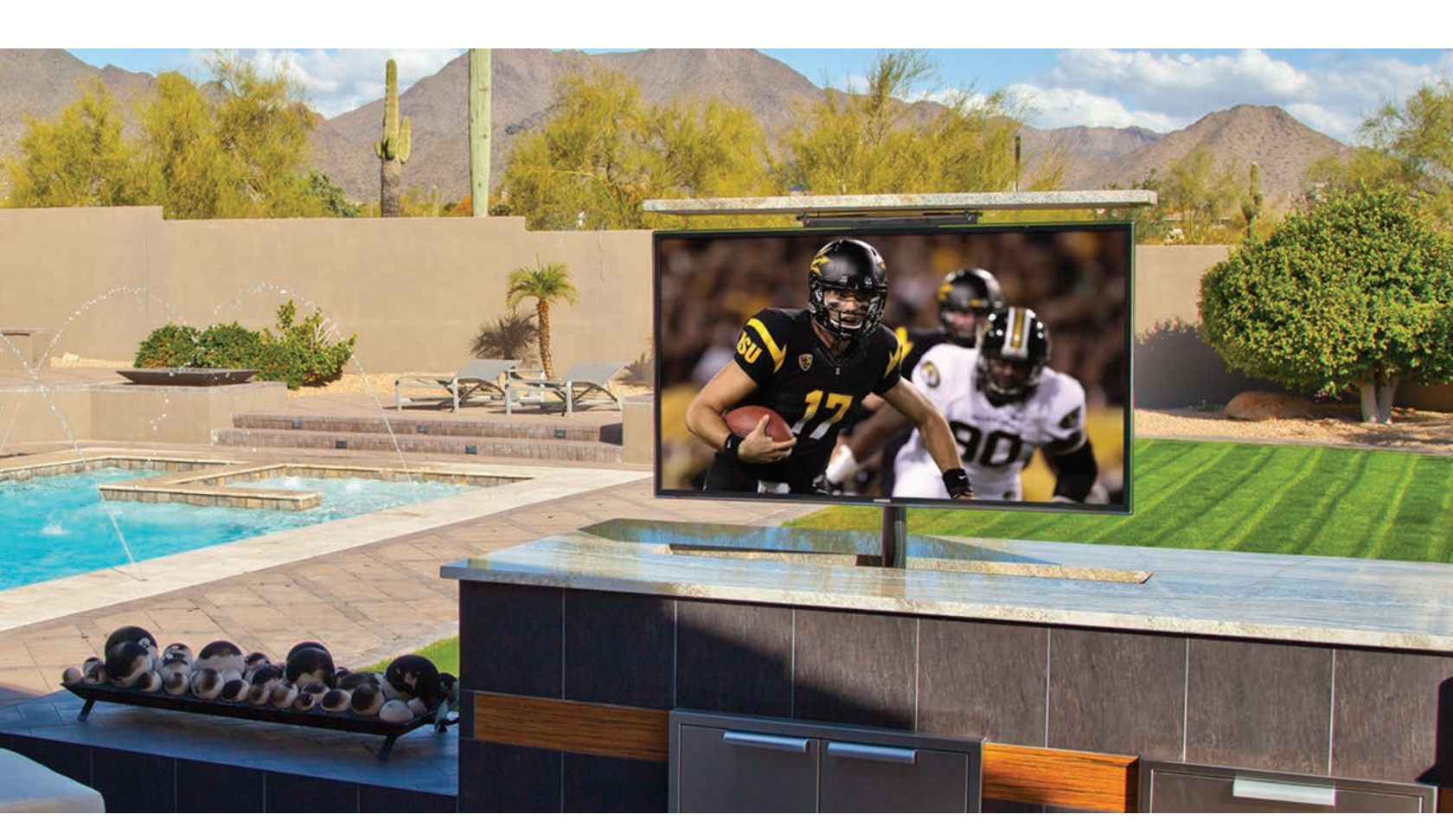
Nexus 21 solutions come complete with everything required for assembly and installation. Motorized systems are covered by a 10-year warranty and all products are backed by our world-class product support team.