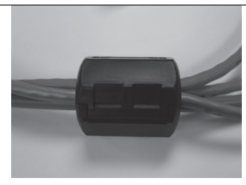
Ferrite ring closed - with cables